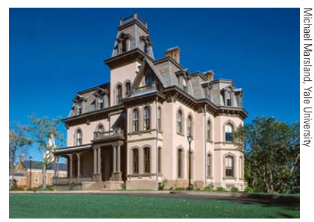
The renovated Davies Mansion, now known as the Yale Betts House

historic property, the Trust can advocate for that property before the New Haven Historic District Commission. It has helped save many historic buildings this way, including